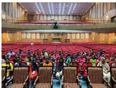
At Christ University.....