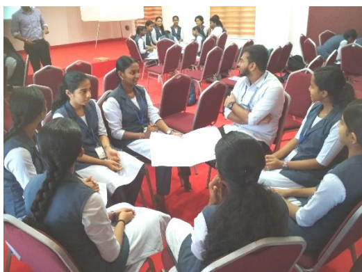
Group Dynamics in progress....