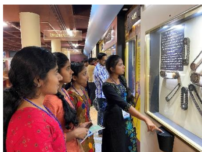
At Visweswarayya Industrial & Technological Museum.....