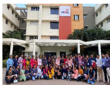
At CENSE, Bangalore