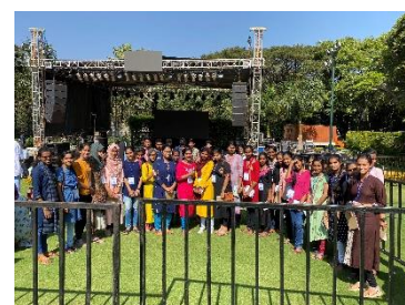
Scholars at IIM, Bangalore