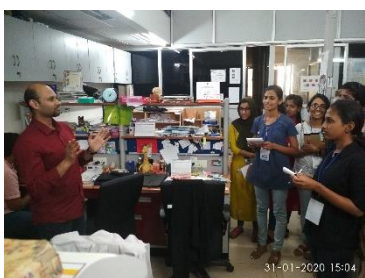
Interaction with Experts